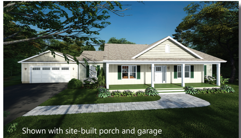
Shown with site-built porch and garage

Great curb appeal coupled with an open floor plan and today's favorite features make the Newport II Ranch an excellent choice for those seeking a well designed, single-level plan.