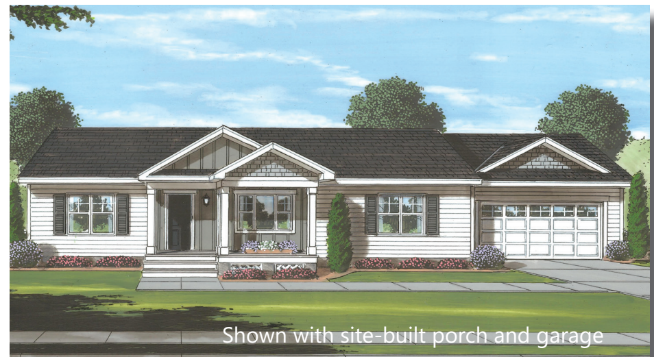
Shown with site-built porch and garage

The interior plan is wide open and family sized. Upon stepping from the foyer, you’ll be greeted by a wide view of the large living, dining and kitchen spaces. The kitchen features an island bar with sink, lots of counter space and seating for 4. The nearby utility room allows access to the garage location and features custom cabinetry with utility sink and a conveniently located drop-zone bar with charging ports. All bedrooms include large walk-in closets and the master suite’s private bath includes a large double vanity and compartmented shower.