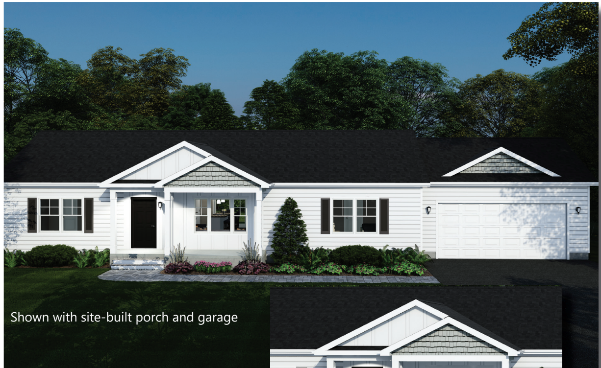
Shown with site-built porch and garage