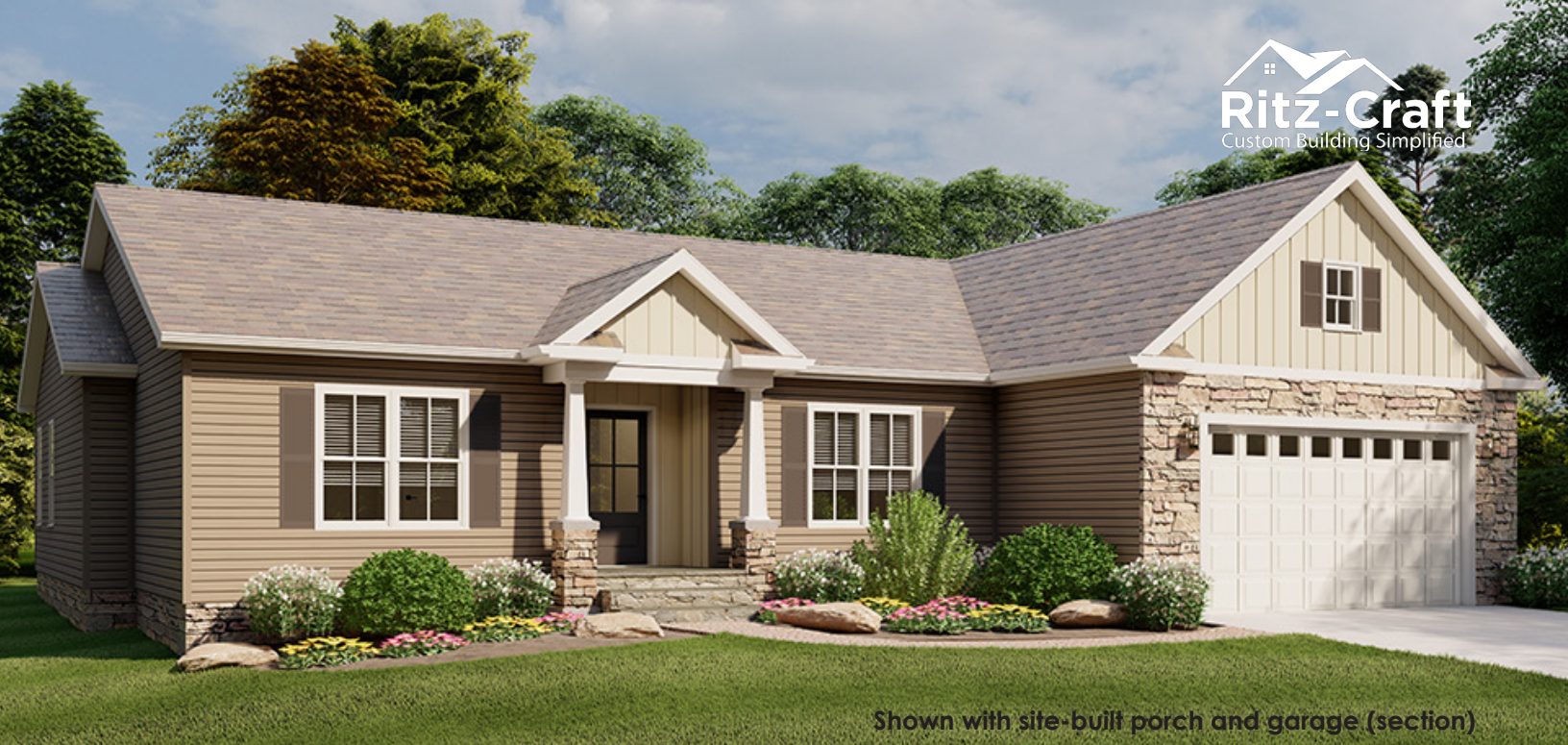
Shown with site-built porch and garage (section)